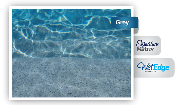
When viewing up close you can see that it is a grey finish

Some finishes like the Prism Matrix or Primera Stone have jazzy glass beads and recycled glass as accents. The "eye-candy," as we refer to it, is only seen when you are close to the pool. The accents cannot be seen from a distance.