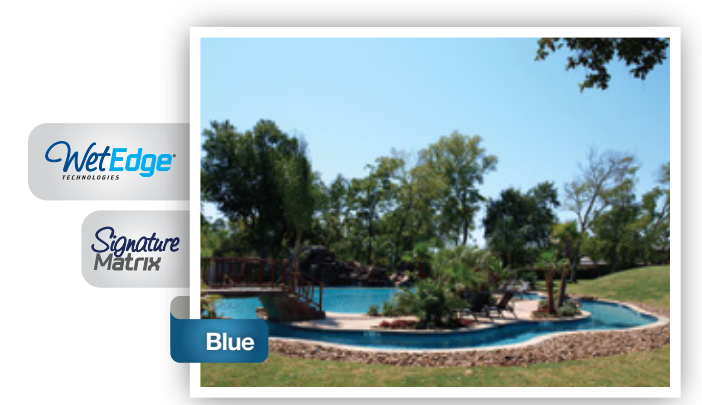
Large and deep pools give the water a richer and more vibrant color.