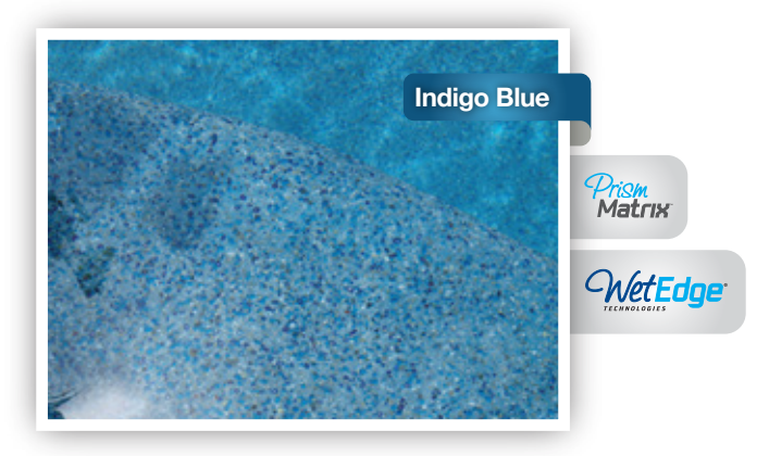
Glass beads, recycled glass, polished pebble are appreciated more close up

Gorgeous water colors can be enjoyed from distance